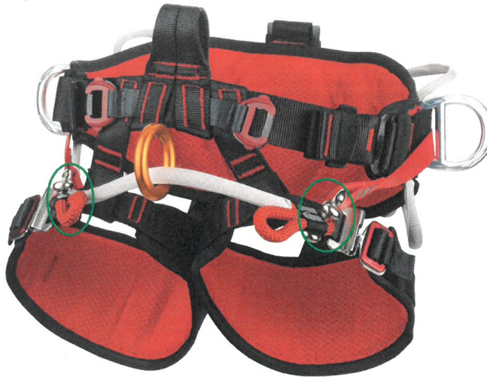
Ref.2163, Tree Access Evo

The rope bridge on the harness model Tree Access Evo (ref.2163) is fastened by means of screw-closure metal rings. The screws allow the user to replace the rope bridge in case of wear-and-tear. See image below.